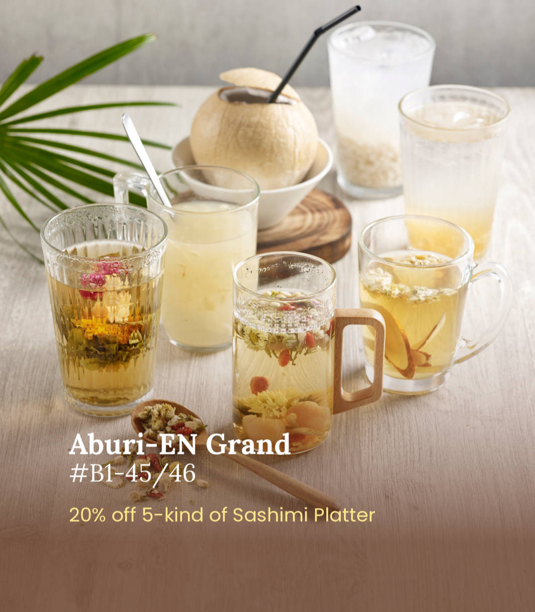
Aburi-EN Grand #B1-45/46