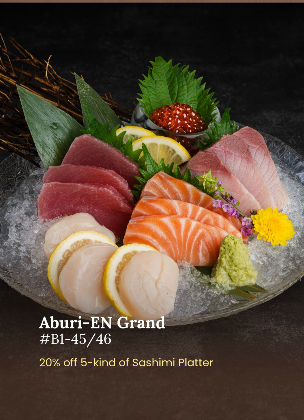
Aburi-EN Grand #B1-45/46

20% off all Classic Sandwiches , Favourite Thins and Focaccia Tartine